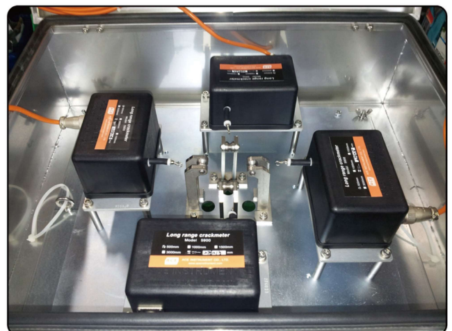
[Head parts of multi array]